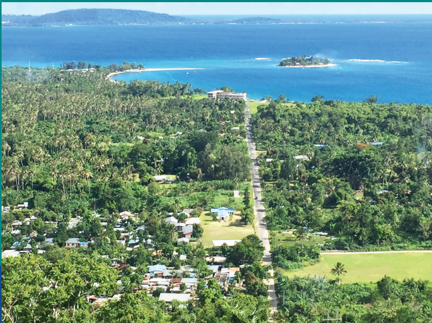
Mele Village, Efate, Vanuatu. A community resettled to Efate following the volcanic eruption on the island of Ambrym in 1951.