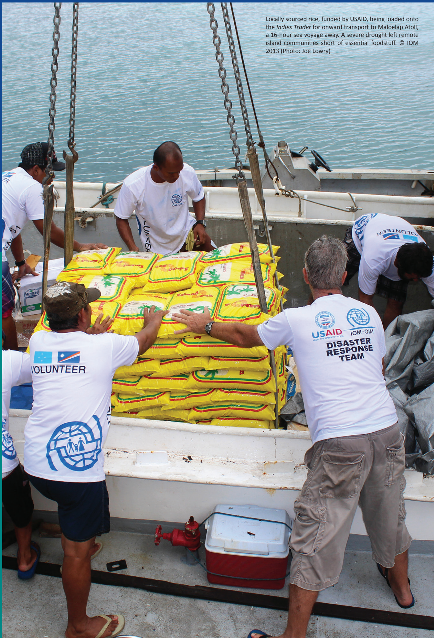
Locally sourced rice, funded by USAID, being loaded onto the Indies Trader for onward transport to Maloelap Atoll, a 16-hour sea voyage away. A severe drought left remote island communities short of essential foodstuff.