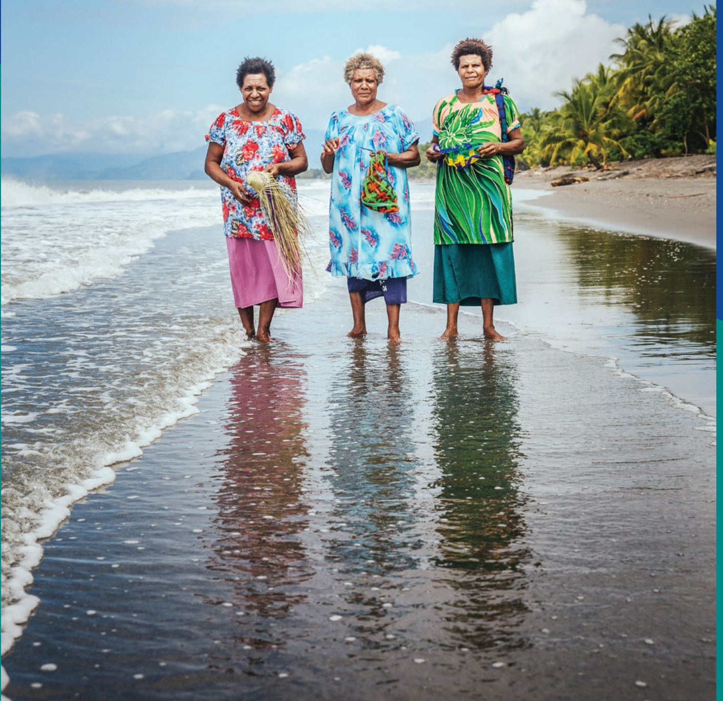
A local counsellor and women from a coastal village stand where their crops and homes used to be before the impacts of coastal erosion, Papua New Guinea.