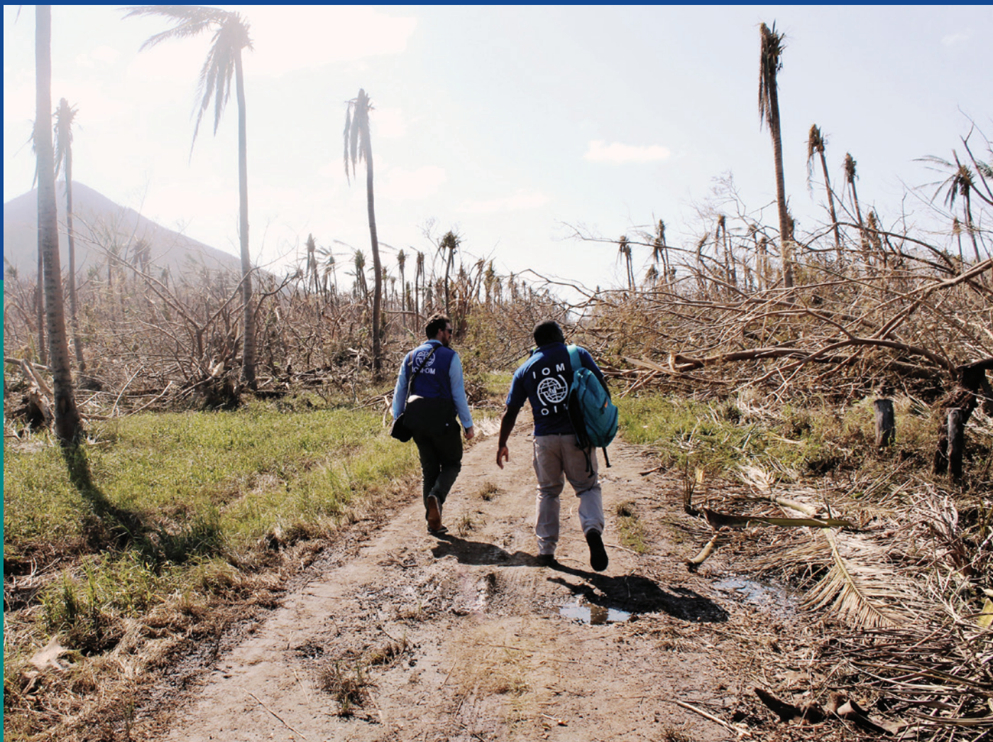
Trekking across Emae Island, Vanuatu.

Employer scheme and Australia’s Seasonal Worker Programme opened to selected Pacific Islands. 9 The United States’ Compact of Free Association agreements with the Federated States of Micronesia, Palau and the Marshall Islands allow all citizens of those countries to live and work in the United States with unlimited lengths of stay. At present, many Pacific Islands have large shares (over 30%) of their population living abroad, explained in part by these preferential entry arrangements especially with Pacific Rim countries. 10