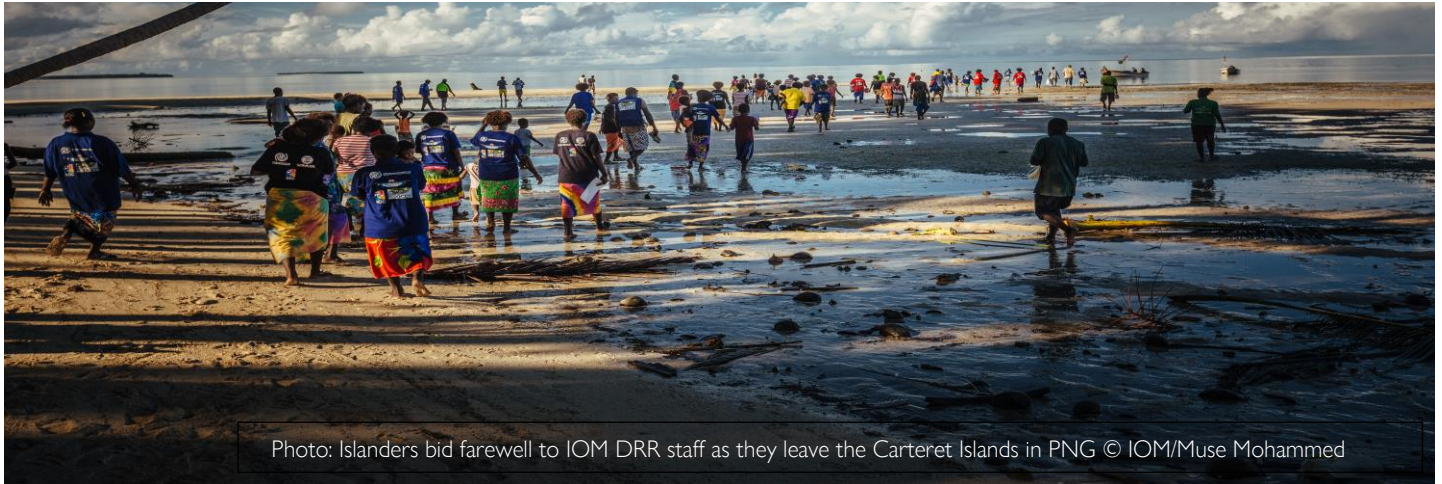
Photo: Islanders bid farewell to IOM DRR staff as they leave the Carteret Islands in PNG