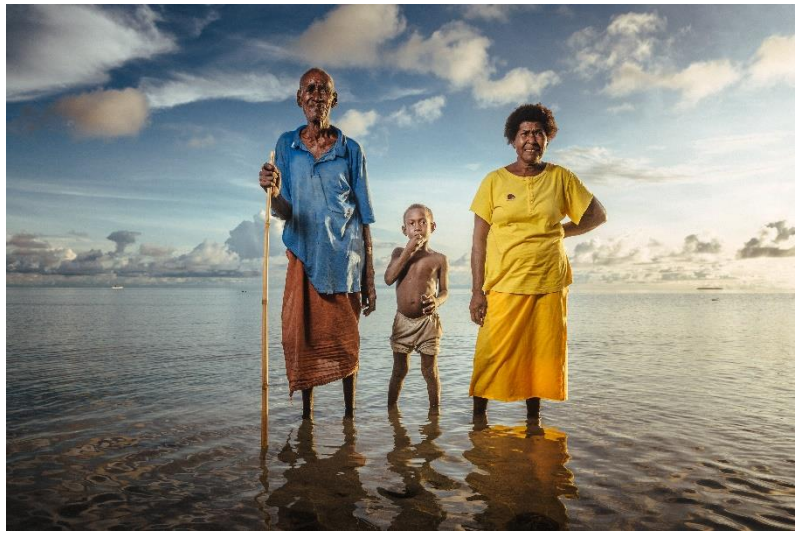
Three generations of villagers pose for a picture along the shoreline on one of the Carteret Islands, PNG. Due to coastal erosion, the islands have progressively become uninhabitable as their homes slowly become consumed by the sea over several decades.

The high-frequency, prevalence and intensity of sudden- and slow-onset natural disasters in the Pacific result in significant damage to infrastructure and displacement beyond the coping capacity of national authorities. Climate variables, such as the El Niño Southern Oscillation and longer-term climate change symptoms are affecting and increasing hazard risks within the region. Although Pacific Island States have established institutions to support the response, risk reduction and mitigation, logistical challenges, limited infrastructure, assets and human resources remain a challenge. These factors can result in increased vulnerability to population displacement, which gives rise to acute protection and humanitarian needs.